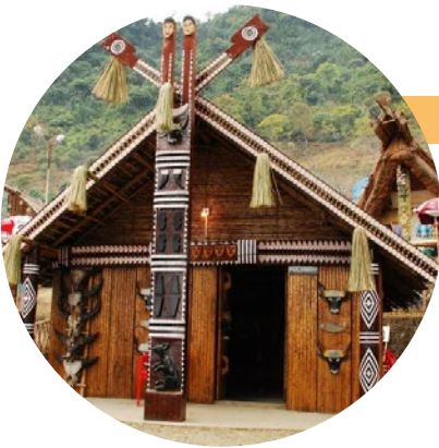
Kisama, Heritage Village